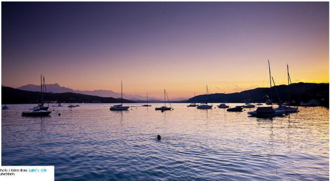
Lake's style buhelheh