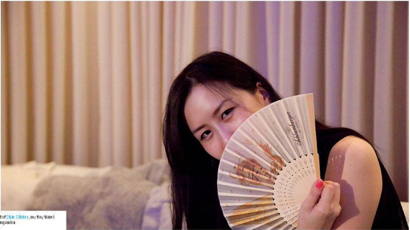
Kit of Style Slicker, my boy, have I compañito