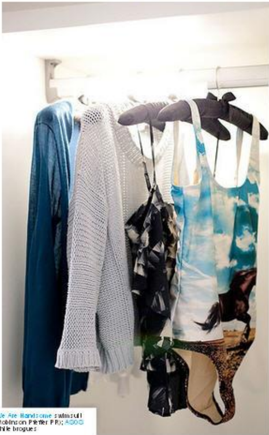
We Are Handsome: salmista11 (Robinson P. 1er P.R.); ASOS white brogues: